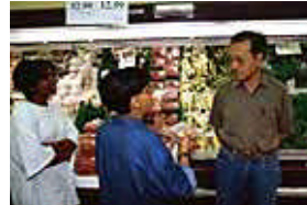
MS11-FOOD SHOPPING WITH FAMILY