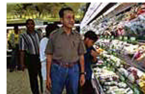
MS12-FOOD SHOPPING WITH FAMILY