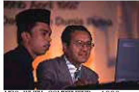
MS2-WITH COMPUTER, 1996