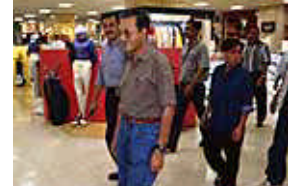
MS8-SHOPPING WITH FAMILY