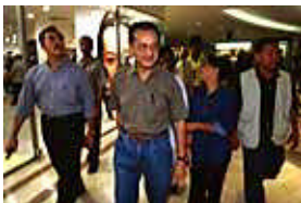
MS9-SHOPPING WITH FAMILY