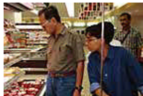
MS10-FOOD SHOPPING WITH FAMILY