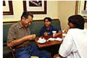
MS15-EATING WITH FAMILY